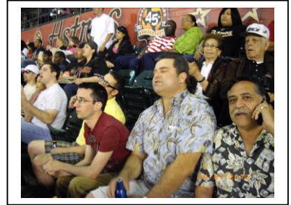
Council 803 having fun at the astros game Tuesday April 21. The astros came from behind to win the game 5-4.